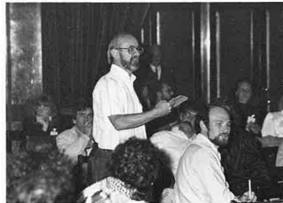
Father Ignacio Martín Baró speaks at a UCA forum in 1988.

Juan Ramón Moreno was born in Villatuerta, Spain, in 1933, and in 1951 was sent to El Salvador to complete his novitiate. He studied humanities in Ecuador before being sent to teach at the Jesuit high school in Granada, Nicaragua, in 1958. After further study abroad over the next decade, Father Moreno returned to San Salvador in 1971 and taught at the UCA until 1974. He spent two years in Rome and then was sent to Panama in 1976, where he founded the Central American Ignatian Center to promote the religious tradition of Jesuit founder St. Ignatius of Loyola. He moved along with this Center to Managua, Nicaragua, and remained there until he was sent back to El Salvador in 1985. Father Moreno then became the deputy director of the UCA's Oscar Romero Pastoral Center and also served as librarian of its Center of Theological Reflection. In addition, he was secretary to the Central American Jesuit Provincial and served a parish in Santa Tecla.