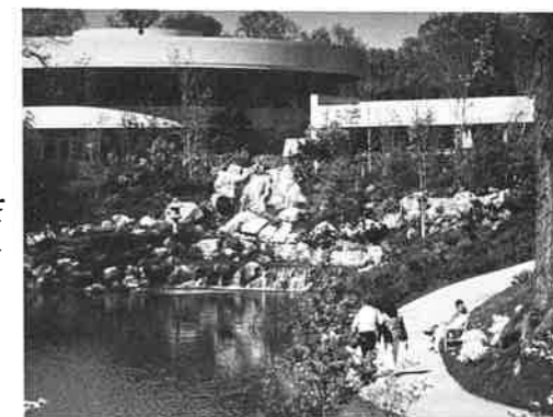
The Carter Center

The construction of The Carter Center facilities was funded entirely by $28 million in private donations from individuals, foundations, and corporations. Dedicated on October 1, 1986, the complex of four interconnected buildings on 30 acres houses CCEU and the Jimmy Carter Library and Museum, deeded to and operated by the federal government. The Center is also home to Project Atlanta, Global 2000, The Task Force for Child Survival, and the Carter-Menil Human Rights Foundation, a group of independently funded and administered organizations with goals and ideals that complement and enhance The Carter Center as a whole.