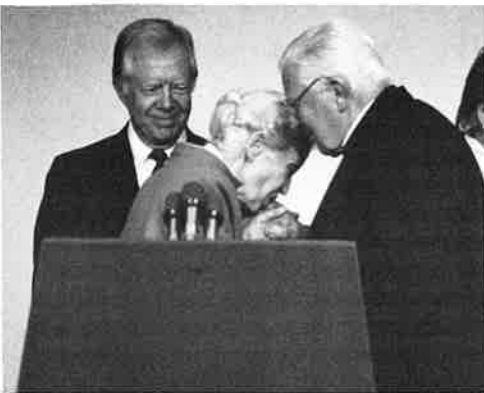
La Vicaría de la Solidaridad, Chile