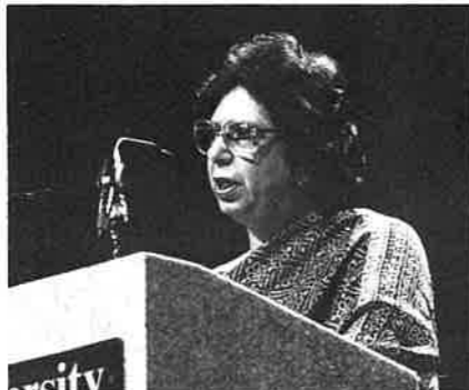
The Civil Rights Movement of Sri Lanka (co-recipient)

The Civil Rights Movement (CRM) of Sri Lanka is a nonpartisan, inter-ethnic organization committed to the promotion and protection of civil and political rights. The group was founded in 1971 in response to government emergency measures introduced to deal with a militant insurgency. Though this insurgency was speedily crushed, CRM worked vigorously to counter human rights violations that emerged in its aftermath such as prolonged detention, deaths in custody, unfair trial procedures, suspension of trade