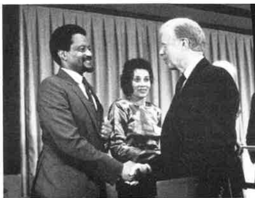
The Sisulu Family, South Africa

restrictions were lifted in a historic decision by the South African government in October 1989.