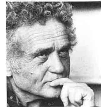
Yuri Orlov, Soviet Union (co-recipient)

Soviet physicist and dissident Yuri Orlov founded the Moscow Helsinki Committee in May 1976. His outspoken criticism of the Communist party and human rights activism led to his expulsion from the party in 1956 and arrest in 1977. Dr. Orlov spent seven years in a strict regimen labor camp and two years in exile in Siberia before being released and moving to the United States. In 1987, he accepted a position in the physics department at Cornell University and continues his human rights activities as honorary chair and spokesperson for the International Helsinki Federation for Human Rights.