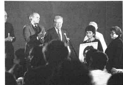
Grupo de Apoyo Mutuo, Guatemala (co-recipient)

The Grupo de Apoyo Mutuo (GAM) was created in June 1984 by relatives of the disappeared in Guatemala attempting to determine the fate of their missing family members by making inquiries to the government, filing habeas corpus petitions, and denouncing disappearances in local and international forums. GAM's current membership of over 1,500 continues to serve the important role of uniting and supporting families who have suffered and leading protests to call attention to these situations. Because of these efforts, members themselves have been the victims of repeated threats, torture, kidnapping, and, in some cases, murder.