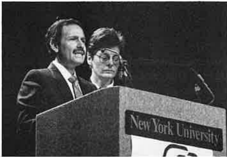
The Consejo de Comunidades Etnicas Runujel Junam, Guatemala (co-recipient)