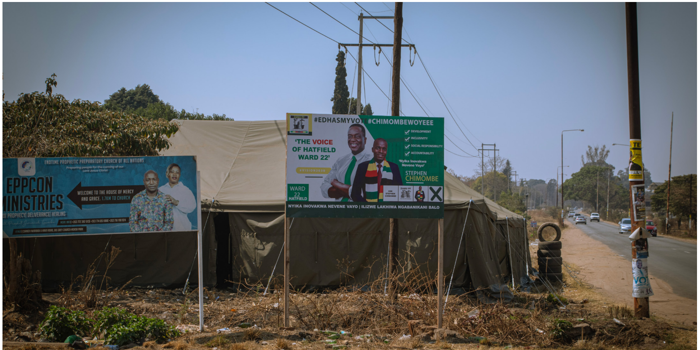
Campaign signs promote ZANU-PF candidates in Hatfield, a suburb of Harare. ZANU-PF presented candidates in each of Zimbabwe's 210 constituencies.

in the impartiality and inclusivity of the appointment mechanisms of the ZEC as well as recruitment of lower-level election commission members. In addition to publishing the names of presiding officers in the official Gazette, clear selection criteria should be published prior to recruitment.