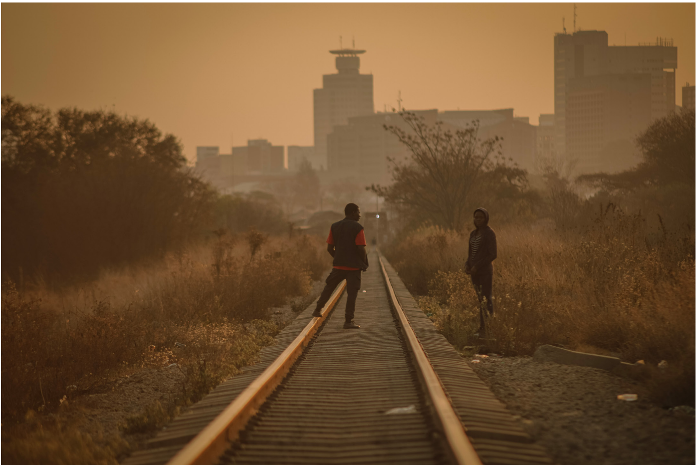
Harare, Zimbabwe’s capital city, during the election period.