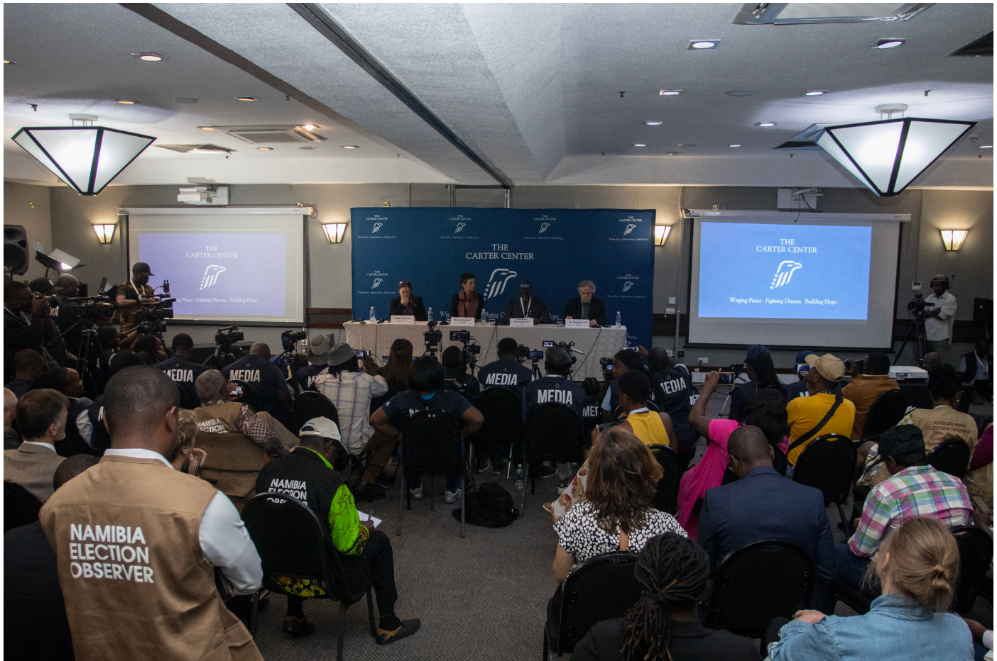
The Carter Center holds a press conference to release its observation findings and conclusions in the immediate days following the election. The Center found that Zimbabwe's 2023 election was held in a highly polarized political environment.

violence among candidates and their supporters, and may have affected the campaign environment and candidates' ability to reach voters.