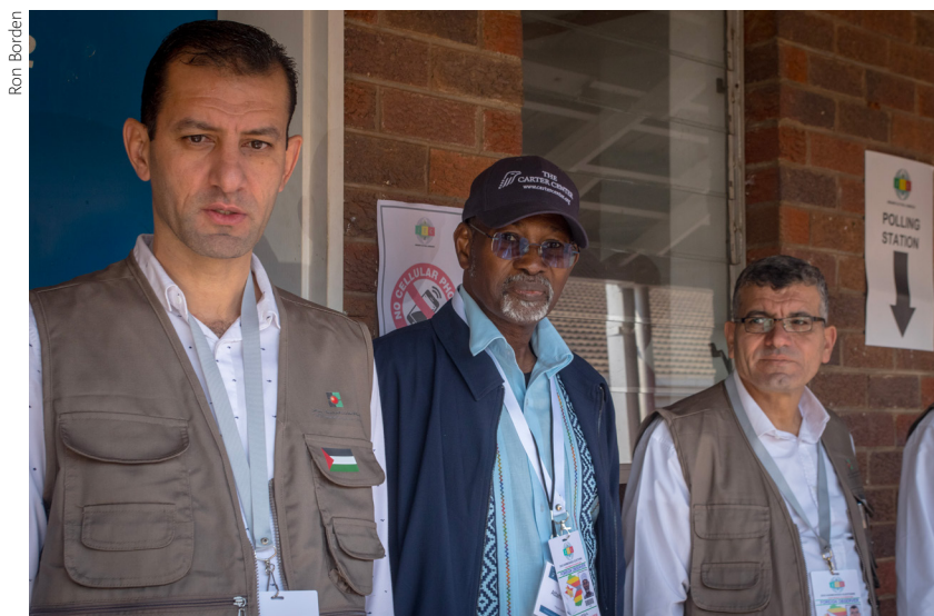
Mission Leader Attahiru Jega stands with two election observers outside a polling station.

Most parties and their candidates, as well as independent candidates, reported that they struggled to raise funds for nomination and campaigning, including parties that had access to public funding.