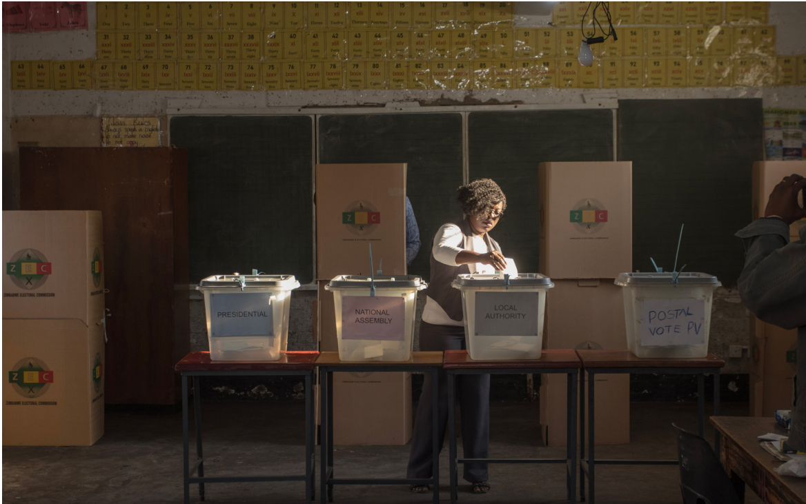
A woman places her vote in the ballot box. In Zimbabwe's 2023 elections, women made up about 53.7% of registered voters.

seats. 147 Following the 2021 amendments, some seats out of 10 reserved for youth were also reserved for women in the National Assembly. 148 As an additional safeguard for diversity, Section 124 (1) of the constitution requires political parties to ensure that 10 of the 60 women on the PR lists are under age 35 and that women with disabilities are represented. However, the constitution does not mandate where young women or women with disabilities appear on the party lists, thus reducing the likelihood of their being elected to public office if their names do not appear in top positions. Moreover, there are no mechanisms in place to ensure that political parties comply with this requirement.