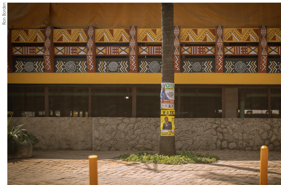
Campaign posters for ZANU-PF and CCC candidates.

Though these incidents occurred across the political divide, opposition parties—particularly the main opposition party, CCC—and their supporters and candidates were most affected. There were isolated instances of both intraparty and interparty violent clashes among party supporters. The candidate