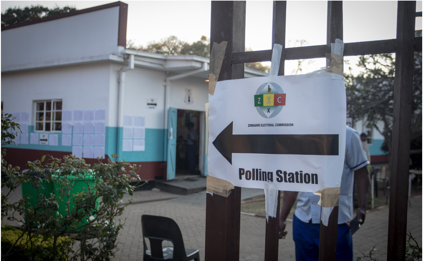
A sign featuring the logo of the Zimbabwe Electoral Commission (ZEC) directs voters to a polling station in Harare. Under the constitution and the Electoral Act, the ZEC manages the conduct of elections in Zimbabwe.

While the constitution provides for elections at regular intervals by secret vote, and guarantees the universal suffrage and equality of vote, legal gaps and, in some instances, the incorrect application