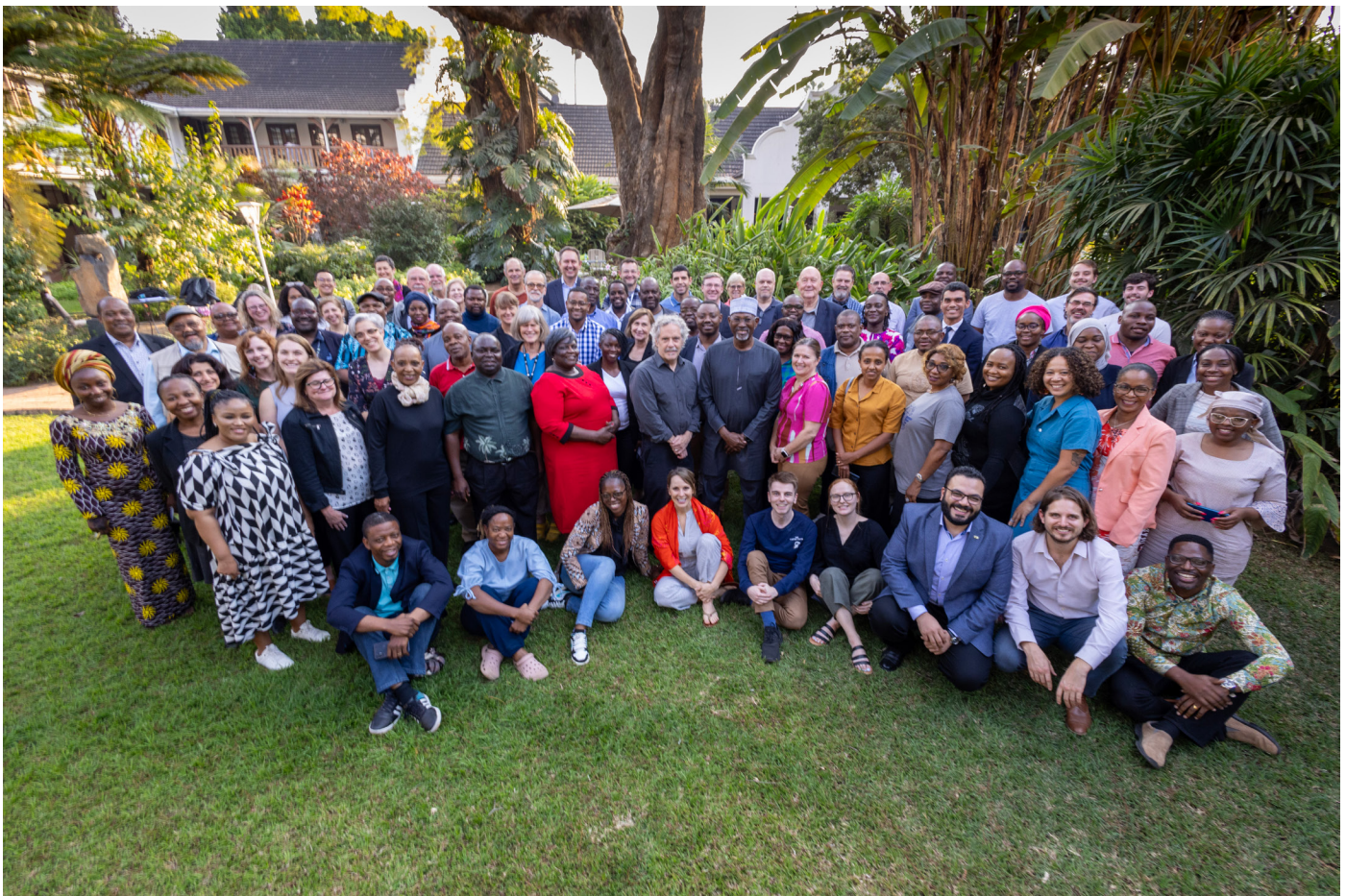
The Center's observer delegation, which included observers from over 30 countries, gathers for a photo in Harare prior to deployment.