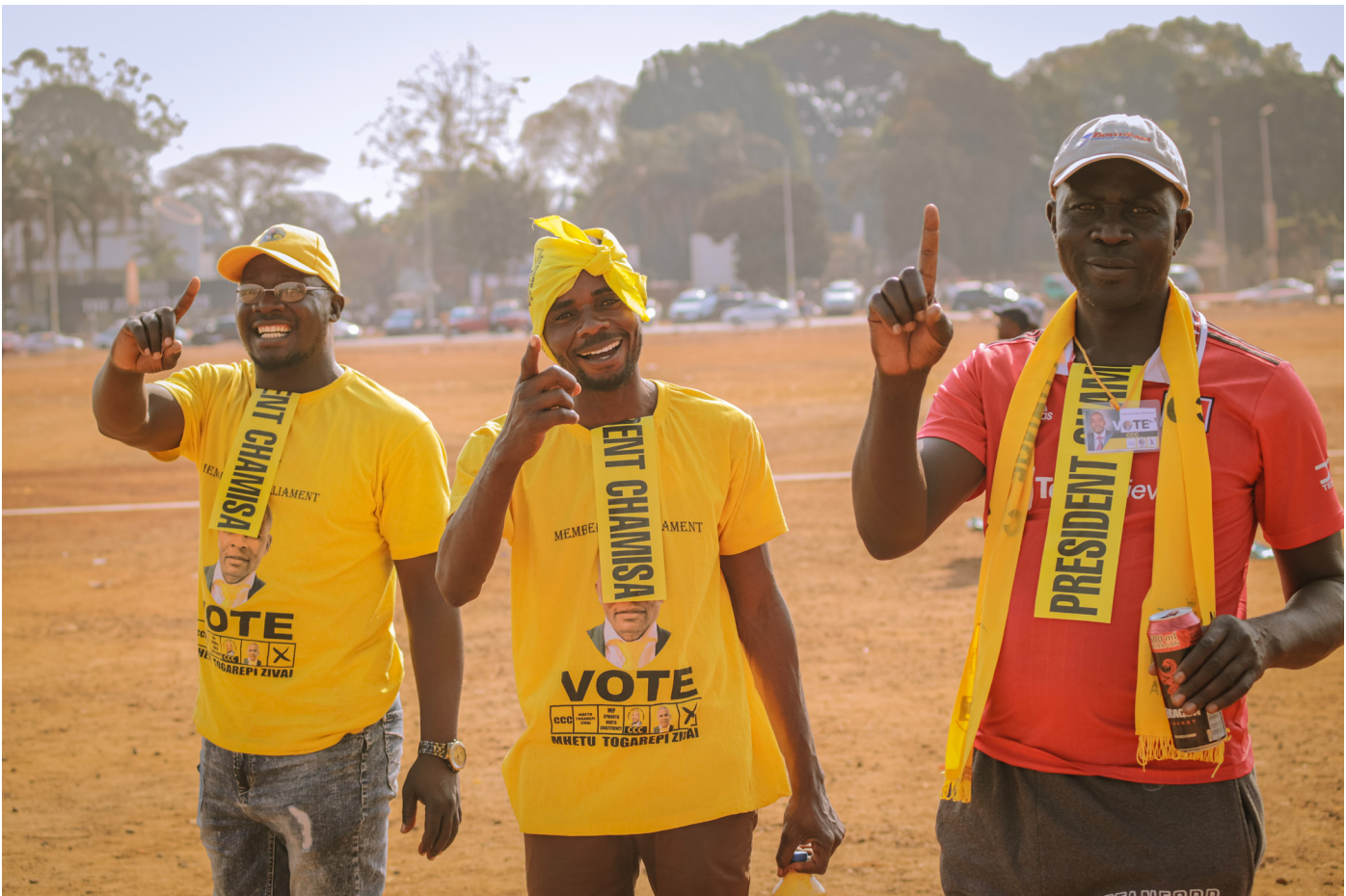
CCC supporters gather for a campaign event in advance of the 2023 elections.