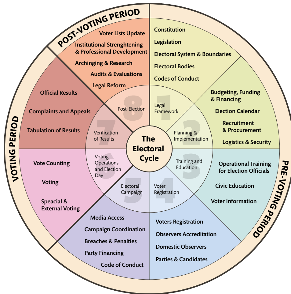
Figure 1: The Electoral Cycle 14