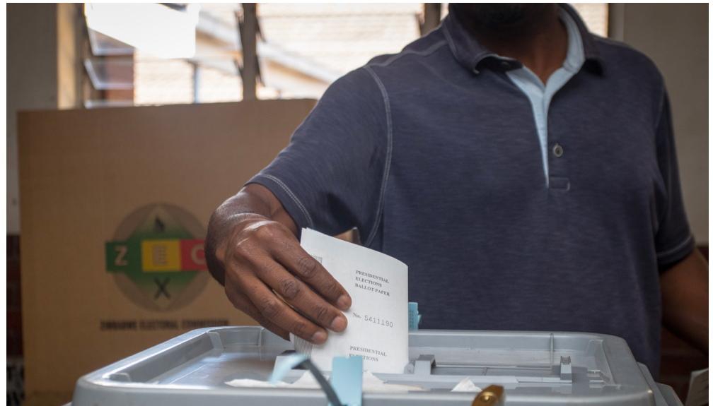
A man casts his vote. Carter Center observers assessed voting at 201 polling stations across Zimbabwe on election day. The ZEC reported a voter turnout of 68.9% among the more than 6.6 million registered voters.

significant delays in delivering ballots and extensive queuing throughout the day negatively impacted voter turnout and voters' perception of the ZEC's ability to effectively facilitate voting. The Carter Center commends the country's many polling station personnel for their professionalism despite logistical challenges.