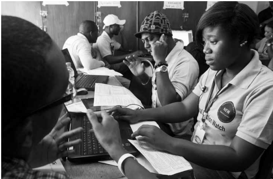
Domestic observers from National Election Watch gather and compile information on election day.

professional associations from across the country. NEW observers were noted in most polling stations visited by Carter Center observers and were assessed as professional and well-trained. NEW's leadership and organizational structure are strong, and its observation was conducted in accordance with the Declaration of Global Principles for Nonpartisan Election Observation and Monitoring by Citizen Organizations, which emphasizes the neutrality and professionalism of observation. 30