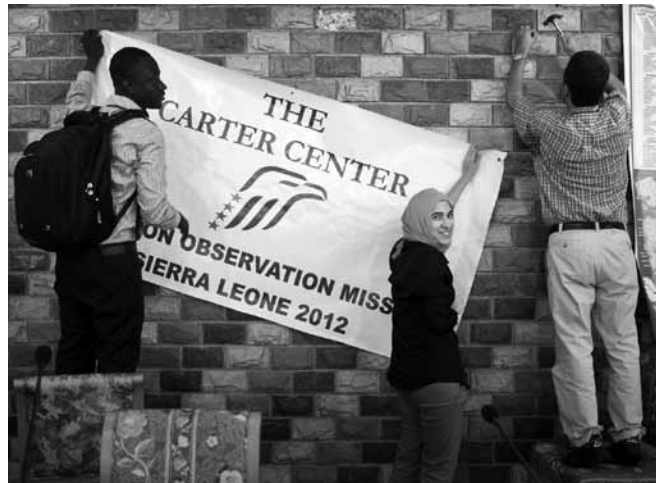
Carter Center staff hang a banner before a press conference.

The media play an indispensable role during democratic elections by educating voters and political parties about major issues, thus giving them access to information so they can make a truly informed decision. Sierra Leone's regional commitments indicate that in order to promote equality, political parties and candidates must have access to the public media on a