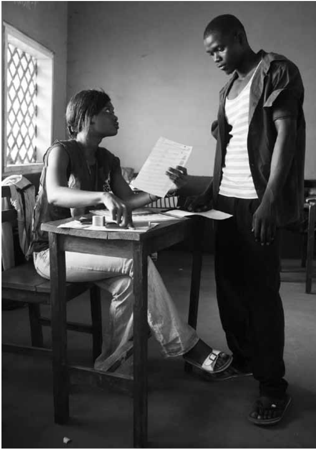
A poll worker distributes ballots and instructions to a young voter.

property for electoral purposes, including in the Western Area region, and noted early campaigning from All People's Congress and Sierra Leone People's Party in Makeni and Bo, respectively.