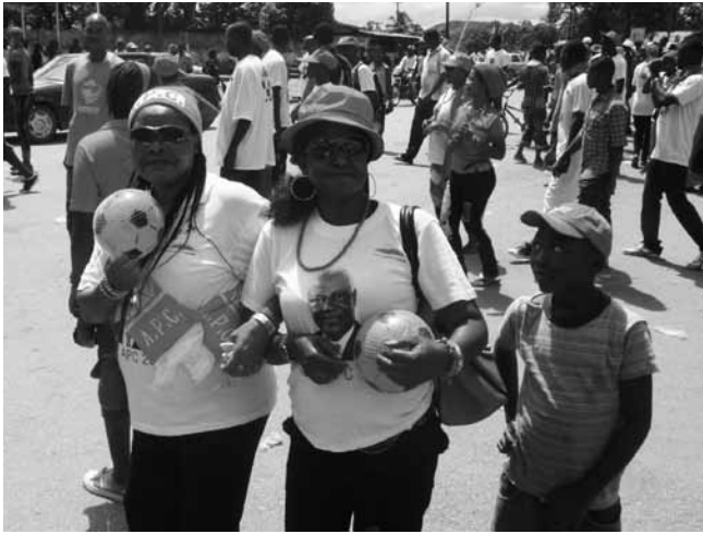
Supporters of the All People's Congress party rallied in Kenema during the campaign.