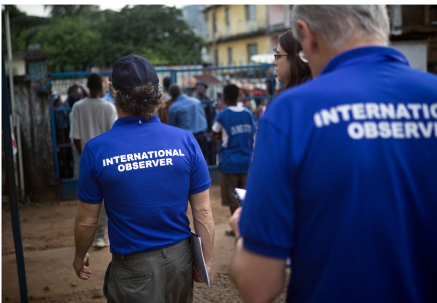
Carter Center observers visit a polling place during Sierra Leone’s 2012 election.

The act of fielding an observation mission also sends an important message to host countries that the international community cares what happens there. Providing recommendations to improve elections