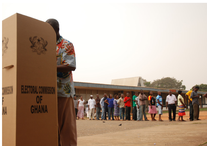
The 2008 election in Ghana was among the first in which Carter Center observers used standardized reporting templates.

Following the successful signing of the 2005 Declaration of Principles, the Democratic Election Standards Project went on to pursue further standardization of observer methodology at The Carter Center. In 2008 the Democracy Program formalized a series of reporting templates to improve the consistency of information gathered on missions and the output of information from each mission. These forms included templates for LTO and LTO coordinator weekly reports; pre-election public statements; campaign rally reports; complaint, violation, and irregularity reports; LTO incident reports; daily deployment check-in reports; and a suite of checklist templates for STOs on poll opening, polling, poll closing, and counting. These forms were first utilized for the 2008 elections in Ghana and then for elections in Indonesia and Lebanon in 2009. They are now a standard part of all Carter Center missions.