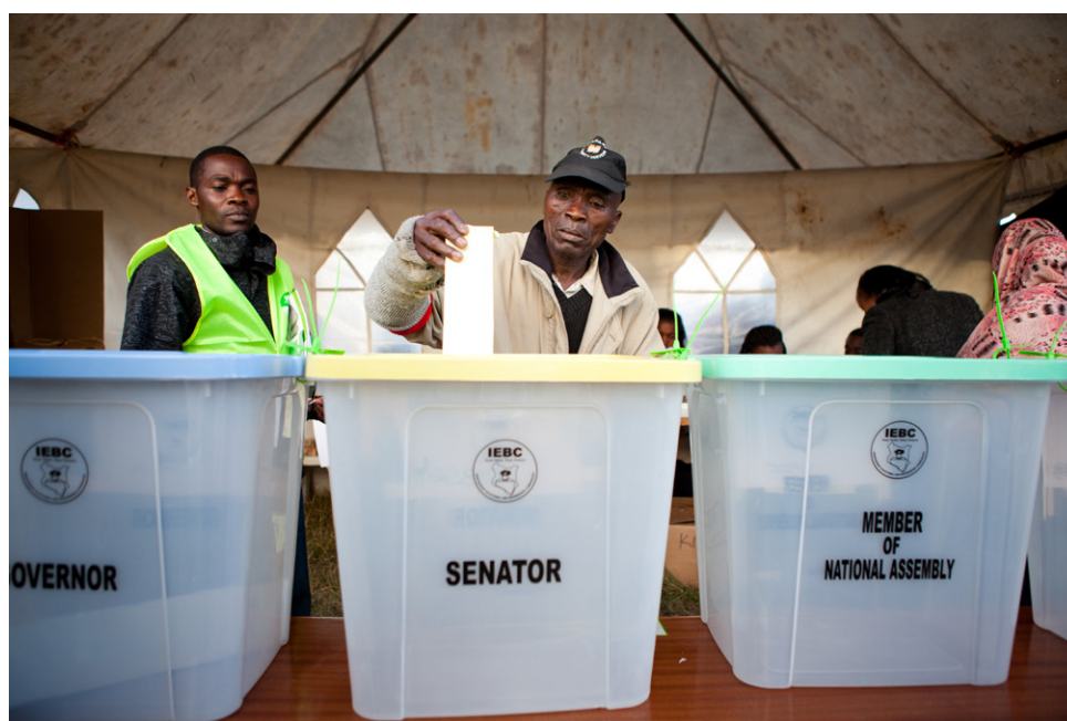
In March 2013, a voter casts his ballot on election day in Nairobi, Kenya. The Carter Center sent a 52-person delegation to observe polling.

In the mid- to late 1990s, election observation at The Carter Center entered a new stage. Increasingly, missions began assessing elections as broad political processes comprising several phases, of which polling is just one. The timeframe for observation expanded and missions began to include the deployment of medium- and long-term observers in the weeks and months leading up to the election-day deployment of short-term observers. They established field offices with staff members who arrived significantly ahead of the election and usually remained months after polling to observe postelectoral processes. The longer these missions became, the more depth their analysis