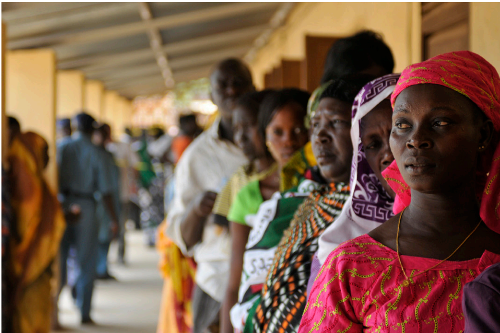
Women wait to vote in 2010 in Juba, which would become the capital of the new nation of South Sudan.

Overall, the growth and development of long-term observation is one of the most significant advances Carter Center election observation experienced in its first 25 years. The extension of the observation timeline is a manifestation of the Center's recognition that electoral processes extend far beyond election day.