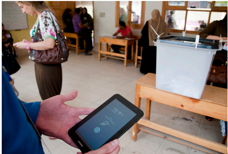
ELMO takes advantage of current technology to speed the delivery of information, as here in Egypt in 2012.

These challenges notwithstanding, the development of ELMO offers an avenue for fostering collaboration in election observation. As an open-source technology, ELMO gives interested parties the ability to use the program freely and, if desired, to tailor it to their needs. In 2014 the Center actively began seeking partners to contribute to ELMO’s evolution, through such activities as customizing the program to fit various types of observation or country