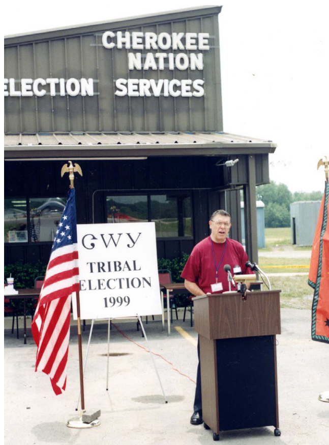
The Carter Center observed the Cherokee Nation election in the United States in May 1999.

From Panama, The Carter Center went on to observe elections throughout the Americas during the 1990s and beyond, from the Dominican Republic to Nicaragua to Venezuela, among many others. The organization broadened the scope of its observation work to Africa with the Zambian elections of 1991, followed by a small mission in Ghana in 1992 and a comprehensive mission in Liberia in 1997. It has remained regularly engaged in African elections on an almost yearly basis ever since. In addition to its enduring involvement in Latin America and Africa,