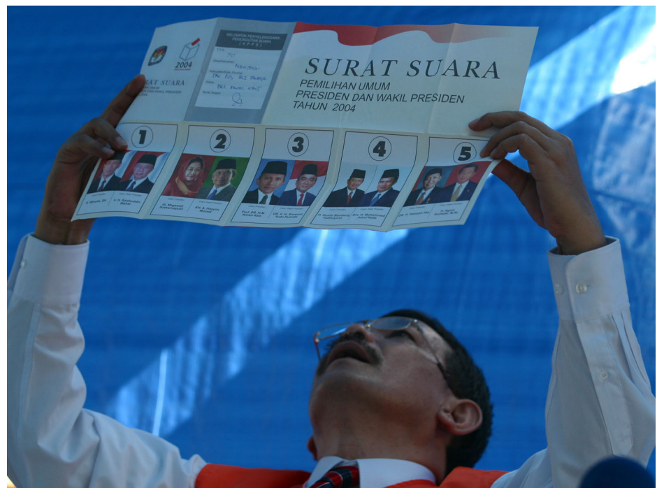
An Indonesian poll worker shows the ballot for the 2004 elections.

“High-level political delegations” consist of one or more visits by Carter Center staff and eminent persons at key moments in the electoral cycle. The Carter Center’s Americas Program, which conducts election observation and other projects in Latin America, has most frequently used this model. Often these delegations work in partnership with the Friends of the Democratic Charter, a group of former distinguished leaders from the Western Hemisphere who advise the OAS on the application of the charter. The delegations usually meet with key actors and tend to focus on one or more key concerns. For example their involvement can demonstrate international interest in the election; encourage a peaceful election process; or aid communication between parties as a means of conflict resolution. Although high-level political delegations may produce public statements, they focus on behind-the-scenes work, frequently offering private recommendations to improve the process or to defuse tense political situations, rather than the public assessment that is a core feature of comprehensive election observation. Such