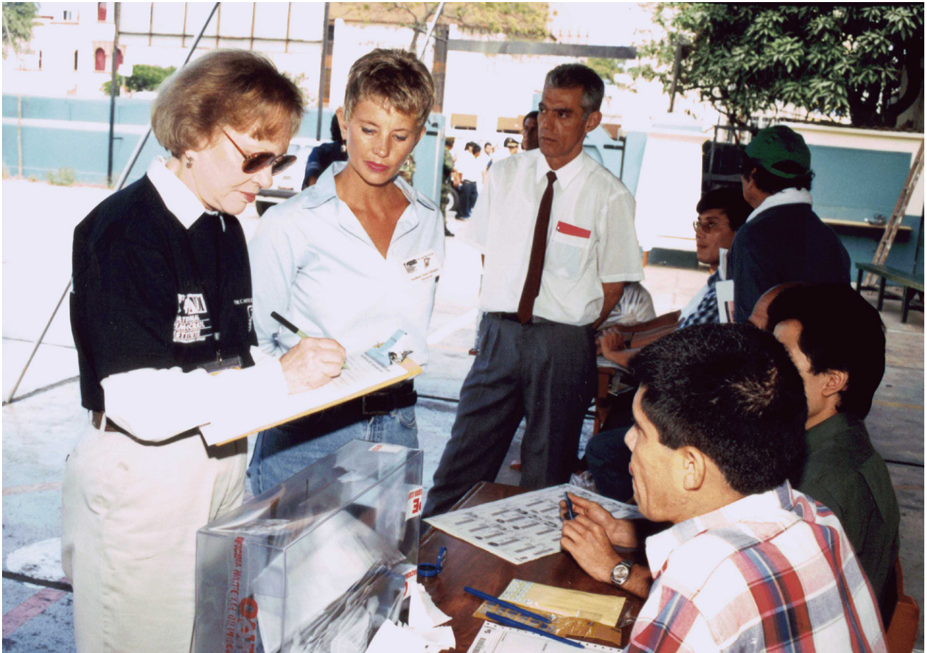
Former First Lady Rosalynn Carter observes conditions at a polling station in Peru. After withdrawing the mission in 2000, NDI and The Carter Center returned to observe in 2001.

delegation to Nigeria in 2003 found that the absence of a firm electoral timetable and faltering confidence in the election commission warranted the withdrawal of the mission. And finally, security concerns related