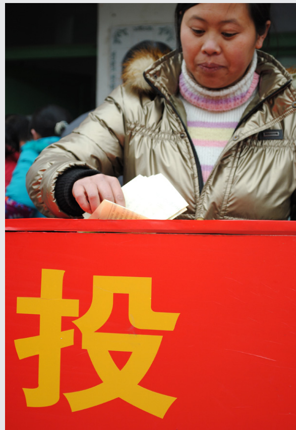
A Chinese woman votes for local officials in 2010.

Early targeted missions included those organized through the China Village Elections Project, which observed its first election in 1997 and went on to observe 13 more. In partnership with the Ministry of Civil Affairs, the project sought to promote fair, competitive elections at the village level and to enhance the governance skills of elected local leaders. These missions consisted of small teams that observed village elections and conducted local interviews, and also met with officials in Beijing to discuss the standardization of village elections at a broader level. The project jointly organized several conferences and connected scholars in the United States and China. More recently, in March 2010 the Center sent its largest mission to China to assess villager committee elections in Yunnan Province.