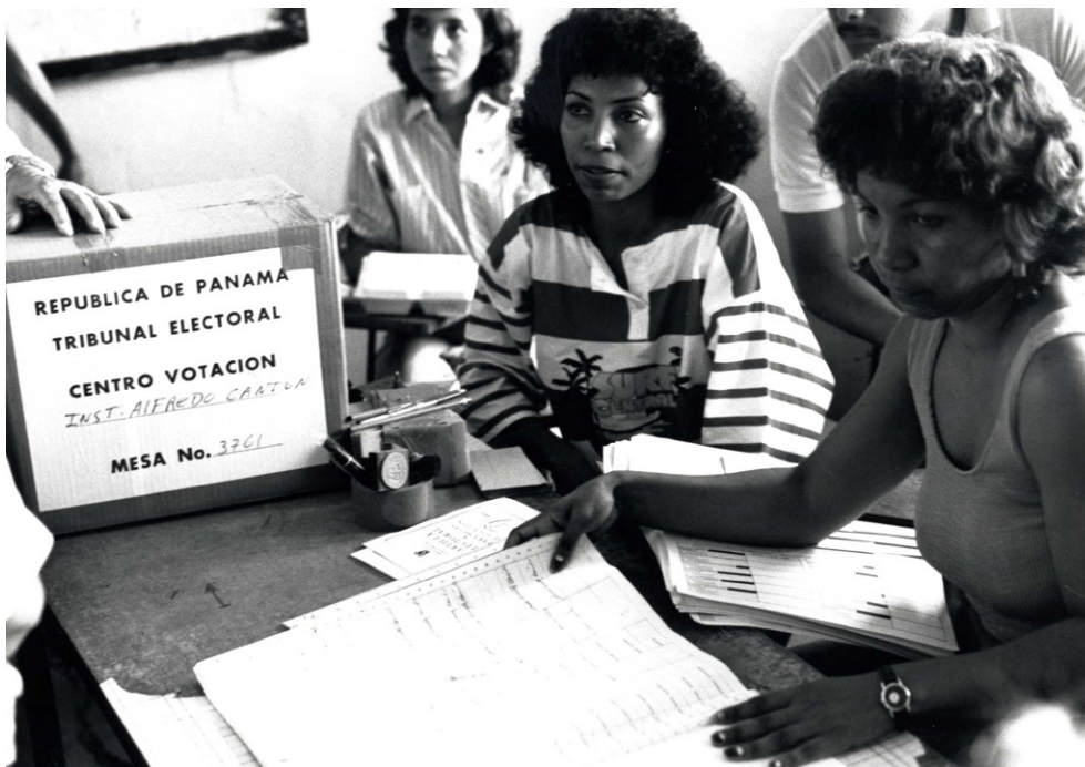
Volunteers handle voter lists during Panama's 1989 election.

Broad, international consensus exists today that credible elections are a cornerstone of the democratic process. Genuine