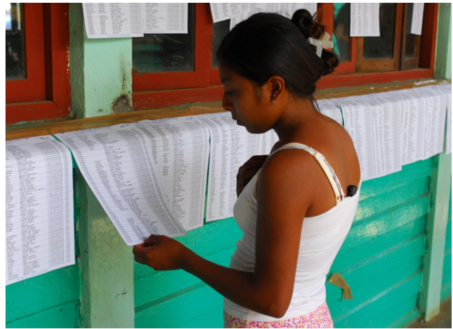
A Nicaraguan woman looks for her name on the voter list in 2006.

As discussed above, The Carter Center has also pursued many “limited election observation missions” (sometimes referred to as “specialized” or “targeted” missions). Like experts missions, these limited missions observe only one or more specific aspects of the electoral process, or occasionally a specific geographic region. Unlike experts missions, however, these teams include short- and/or long-term observers. In addition to the deployment of observers, a limited mission usually includes a field office director, an observer coordinator, a legal analyst, and a security manager, with other personnel incorporated as necessary. They deploy observers to assess specific processes and usually include the release of public statements. Each statement notes the limited nature of the mission’s scope. Like comprehensive missions, limited missions use standardized assessment criteria and methodologies in their work and adhere to election observation principles. An invitation from the host country and accreditation are required. Some