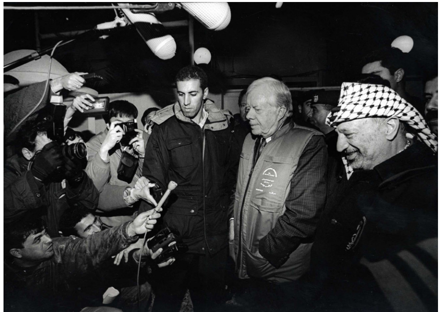
President Carter and Palestinian leader Yasser Arafat speak to reporters during the 1996 Palestinian election.

While early missions focused on short-term observation, some offered glimpses of the extended timeframe that would become the norm. For example, the 1990 mission in Nicaragua covered pre- and postelectoral issues beyond polling, including voter registration and the aftermath of the election, while the 1990 project in Haiti commented on a wide range of issues such as the electoral framework, election law,