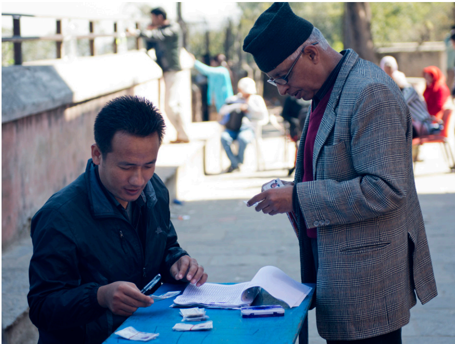
The Carter Center has observed two elections in Nepal, including this one in 2013.

subsequent elections. Observation missions that cover these pre- and postelectoral processes can provide more useful assessments and recommendations.