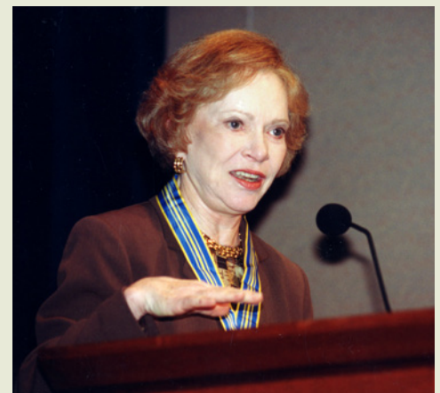
In May, former First Lady Rosalynn Carter, co-founder of The Carter Center, received a global health award from the World Health Organization for her 50 years of mental health leadership.

me in light of the Carter Center's long partnership with WHO to eradicate debilitating neglected tropical diseases and to promote the inclusion of mental health as an integral part of overall well-being. My hope is that this is the moment when all nations will make behavioral health a priority and create quality systems of care that are equitably delivered. I've been waiting a long time to see this happen. I urge all of you attending to use your influence and talent to ensure that it does."