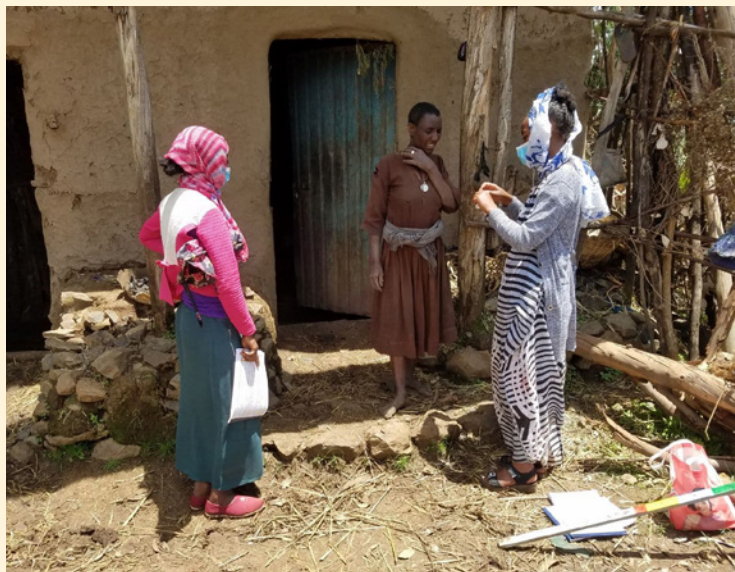
Ethiopian health workers visit a household in the Amhara region to distribute antibiotics and information to combat trachoma, a bacterial eye disease.

I get to be the one to tell you about our progress against trachoma in Amhara, but it's the thousands of health workers, community volunteers, local government and religious leaders, and our Carter Center Ethiopia staff who are on the ground making it happen. Their dedication inspires me daily and gives us real hope that eliminating trachoma as a public health problem is possible.