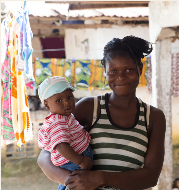
A new program in Liberia will help improve the mental health of new mothers.

Grand Challenges Canada, Grand Challenges Africa, and Open Society Foundations are supporting the adaptation and rollout of the program in Liberia.