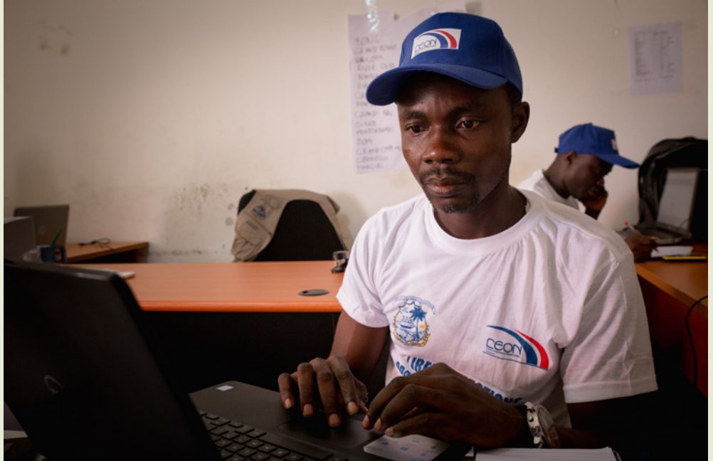
The Carter Center is working with the Liberian Election Observation Network to advance democracy in the country on several fronts, including election observation and government transparency, over the next three years.

LEON also will conduct national surveys on issues of public interest, and LEON's long-term observers will report on political activity across Liberia's 73 electoral districts.