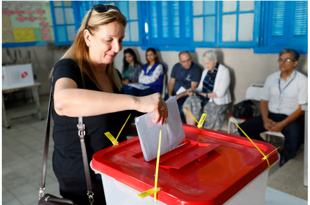
A voter casts her ballot in Tunisia. As online interference increasingly has real-world consequences for elections in many countries, The Carter Center is looking at multiple ways to mitigate threats.

and unforeseen threats emerge all the time. We're going to have to work together as a society to develop solutions that protect the truth and uphold democratic norms without infringing on freedom of expression or the right to privacy.