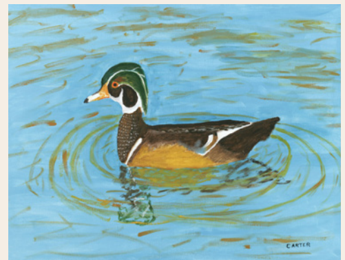
“Wood Duck,” an oil painting by former U.S. President Jimmy Carter, sold for $1 million at a June auction to benefit The Carter Center.

The 2021 Carter Center Weekend raised $1,939,828 in donations and auction sales June 21–26 to support work to wage peace, fight disease, and build hope worldwide. Events included an online auction and broadcast featuring conversations with former Secretary of State Madeleine Albright, celebrity messages, updates from staff in Africa and Latin America, and a live auction of select items.