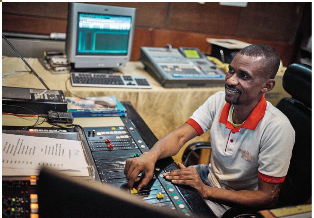
Before the pandemic, The Carter Center provided radio messages in Niger about hygiene practices that would help prevent trachoma, a bacterial eye disease. Now, these same channels include COVID-19 health messages.

Much of the day-to-day work of Guinea worm disease observation and prevention is done by communities themselves