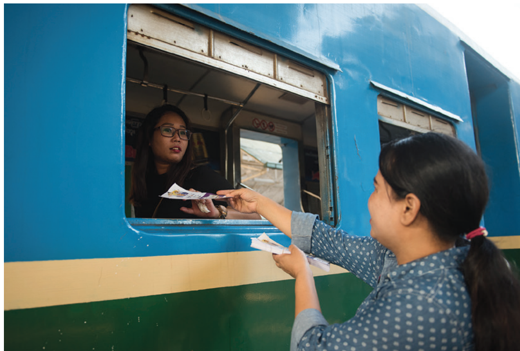
In advance of the 2019 municipal election in Yangon, Myanmar, a woman distributes voting information to a passenger on a commuter train. The Carter Center was set to observe the country’s national election in early November of this year.

This mission, too, included analysis of social media misinformation, disinformation, and hate speech—which is increasingly important because COVID-19 forced many parties and candidates to campaign virtually.