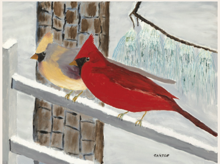
The first-ever virtual Carter Center Weekend fundraiser, held in late August, brought in $2.01 million in donations and auction sales. The highest bid was for former U.S. President Jimmy Carter's original oil painting "Cardinals" (pictured), which sold for $340,000.