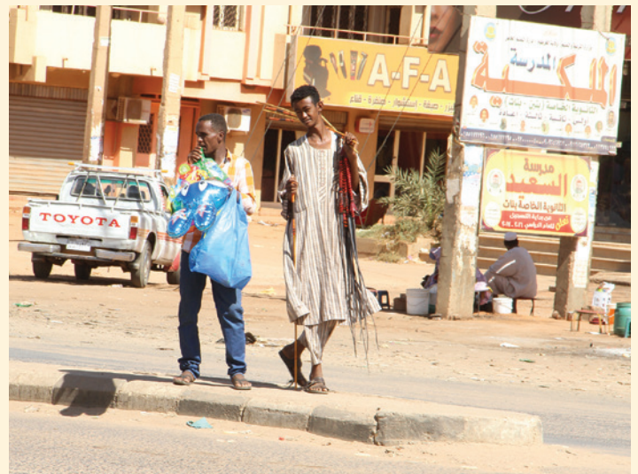
Young Sudanese street vendors await business on a road median in Khartoum. A new Carter Center initiative will train some 20,000 Sudanese under age 35 on democratic processes.

"To achieve the great revolution, [Sudan's young people] will continue to make miracles, and we are all committed," El-Boushi said.