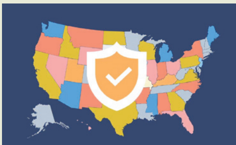
A Carter Center video provided information on voting options for the 2020 election.

An animated video released on social media emphasized the importance of having a voting plan and voting early, by mail, or in person. A second video encouraged patience and calm while millions of absentee ballots are counted.