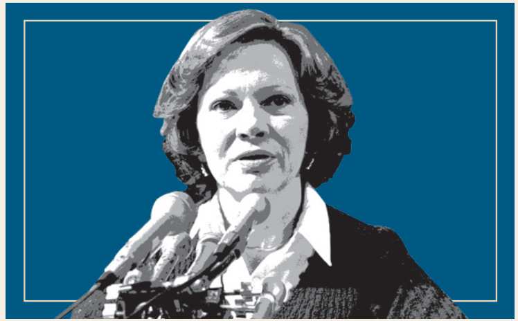
Since 1970, Rosalynn Carter has championed the rights of people with mental illnesses, first in her roles as first lady of Georgia and the United States and then later as co-founder of The Carter Center.

For many years, The Carter Center has partnered with the government of Liberia and others to strengthen public mental health in the country. As regular supporters of the Center for the past 22 years, the Open Society Foundations provided a recent gift to help strengthen the mental health system in Liberia and West Africa