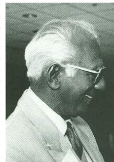
Cheddi Jagan Guyana's President

of our country's growth prospects and requirements and the special needs of less-favored groups in society," said President Jagan during a 1996 meeting with international donor agencies at The Carter Center.