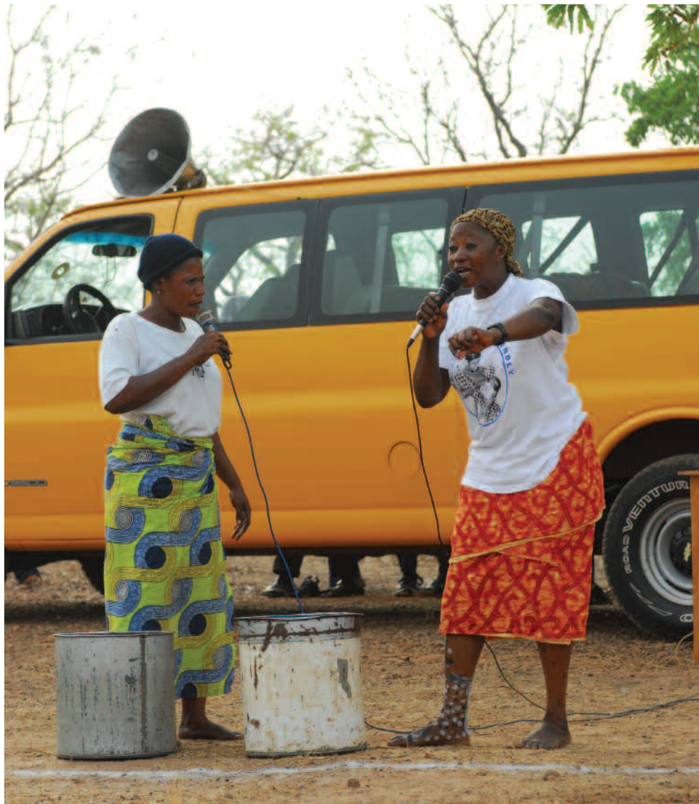
In the community of Tugu, Ghana, two actors perform in a play about Guinea worm prevention. The play uses humor to capture the audience's attention.

Conveying public health messages can be a challenge in isolated communities where few people can read or write. Harkening back to ancient community theater in Greece and Rome, the drama brings education to life through the performing arts.