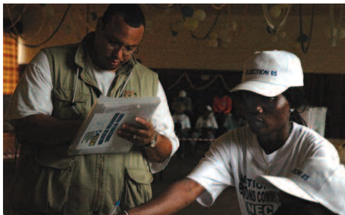
An observer watches election procedures in Liberia in 2005. Irish Aid provided grants for the Center's mission in Liberia and for the development of standards in election observation.

The assistance provided by Irish Aid is a reflection of Ireland's wider foreign policy interests in peace, justice, and human rights issues.