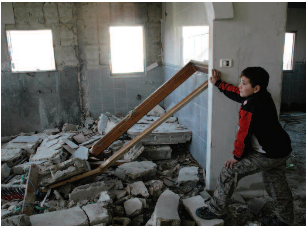
A Palestinian boy looks at the rubble of his home three days after it had been destroyed by Israeli rocket fire. He and his family now live in a refugee camp.