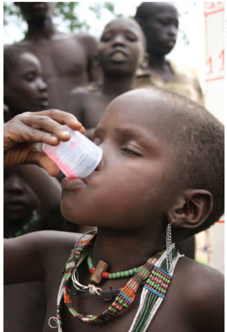
A girl in Eastern Equatoria, Sudan, takes a dose of the antibiotic azithromycin to protect herself from the bacteria that causes trachoma.

“Just imagine how useful it is for people to have a yearly dose of a systemic antibiotic, plus hygiene promotion, plus access to water and sanitation, and imagine what effect that also is having on diarrheal diseases, infection with worms, pneumonia, and other communicable diseases. We can have a powerful effect on health and development through the vehicle of trachoma control,” said Dr. Emerson.