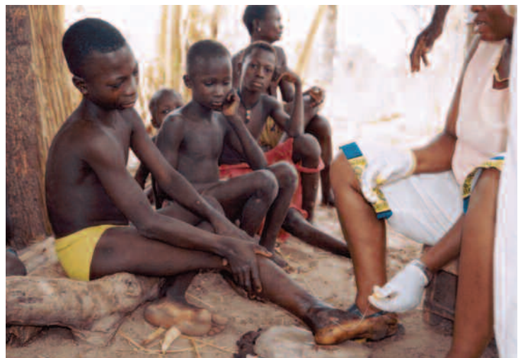
This girl in Togo with Guinea worm disease is featured in the public service announcement running on The Africa Channel.

The channel, which covers many aspects of African culture through news, music and entertainment, and documentaries generated by stations in Africa, will begin original programming in 2007.