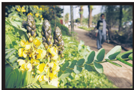
Blossoming in September, Ethiopia is ablaze with these yellow flowers that resemble candle sticks.